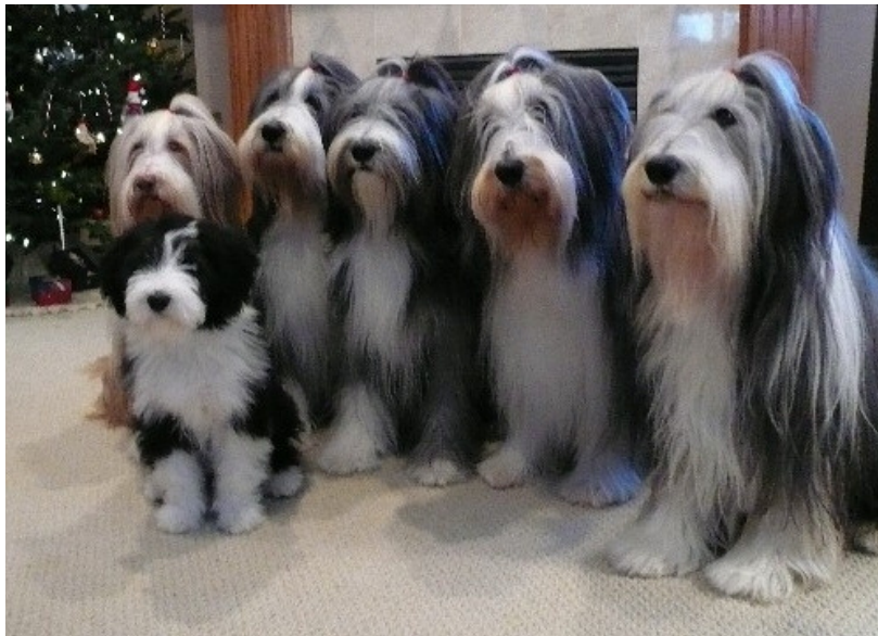
Bearded Collies celebrating the holidays at their breeders' Michigan home. All the dogs owned by this kennel are taught basic manners from an early age. Their breeder is an AKC Canine Good Citizen® Evaluator.

Responsible breeders are experts in their breed, and know the pedigree of the dogs they sell. They can tell potential buyers about the temperament, health, and other characteristics unique to the