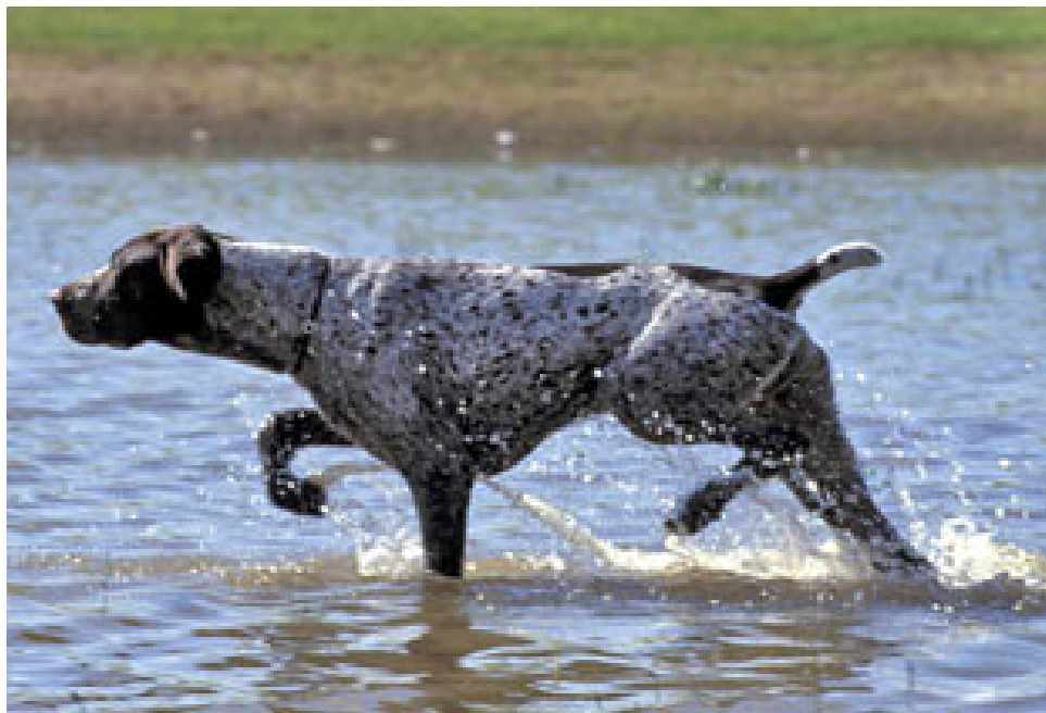
German Shorthaired Pointer competing in a Pointer Breed Field Trial

There are currently 15 different performance events sanctioned by the AKC, each of which is unique and focuses on the qualities and abilities of individual breeds. The AKC and its breed clubs specially tailor each event to highlight the individual skills of different breeds or groups. These include breed-specific Herding, Hunting, and Earthdog (chasing game to ground and holding it) competitions, as