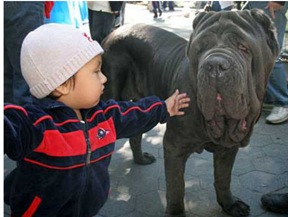
Young Child Meets a Neapolitan Mastiff at a Local Responsible Dog Ownership Day Event

communities about specific dog breeds, allowing people to interact with different dogs and watching them perform in various demonstrations. This included the Oregon State Bulldog Club (Portland, OR), who provided information on their breed to new and long-time owners and promoted themselves as the primary resource for correct Bulldog education and facts for their community. The German Shepherd Dog Club of Southern New Hampshire held herding trials to show spectators exactly what the dogs were originally bred to do (for more infor-