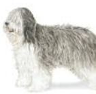
Polish Lowland Sheepdog