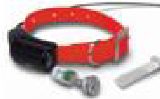
Wildlife Materials Model 3850