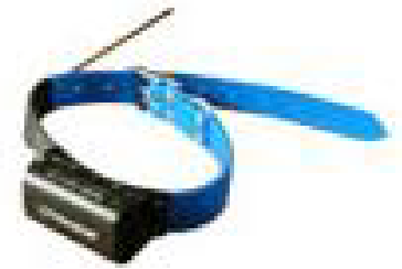
Marshall PowerPoint HP with lithium batteries