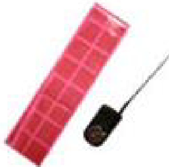
L.L. Electronics CS-4 Flash Collar