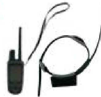
Garmin Collar - DC30 Receiver - Astro220