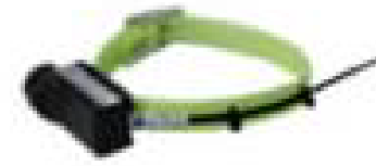
Quick Track Pointing Dog