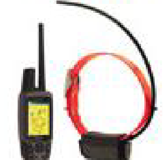
Garmin DC 40 Collar Astro 220/320 Receiver