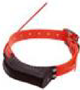
Tracker Strike (TTA - 170)