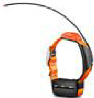
Garmin T5 collar (distinctive feature is the orange cap)