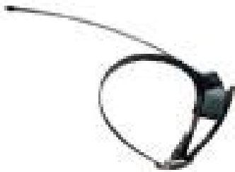
L.L. Electronics LD-3