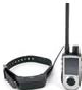
SportDOG TEK-V1L (TEK-L collar & TEK-H receiver) Can not be used with the e-collar module attached.