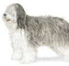
Polish Lowland Sheepdog