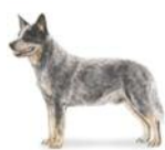
Australian Cattle Dog