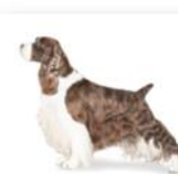
English Springer Spaniel