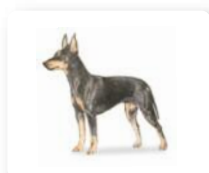
Manchester Terrier (Toy)