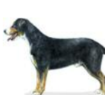
Entlebucher Mountain Dog