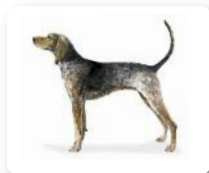
American English Coonhound