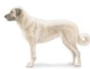
Anatolian Shepherd Dog