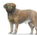
Dogue de Bordeaux