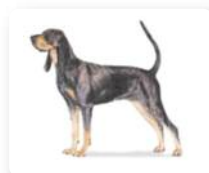
Black and Tan Coonhound