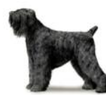
Black Russian Terrier