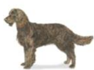
American Water Spaniel