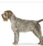
Wirehaired Pointing Griffon