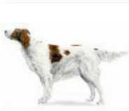
Irish Red & White Setter