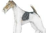
Wire Fox Terrier