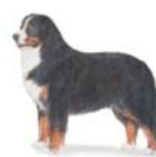
Bernese Mountain Dog