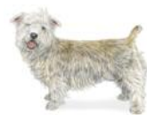
Glen of Imaal Terrier