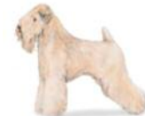
Soft Coated Wheaten Terrier