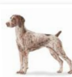
German Shorthaired Pointer