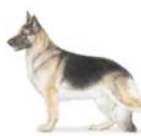
German Shepherd Dog