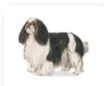
English Toy Spaniel