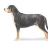
Greater Swiss Mountain Dog