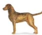
Chesapeake Bay Retriever