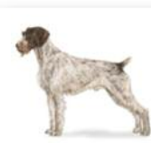
German Wirehaired Pointer