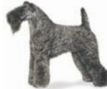
Kerry Blue Terrier