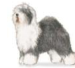
Old English Sheepdog