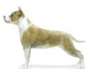
American Staffordshire Terrier