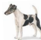
Fox Terrier (Smooth)