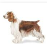
Welsh Springer Spaniel