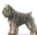
Bouvier des Flandres