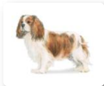
Cavalier King Charles Spaniel