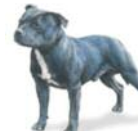
Staffordshire Bull Terrier