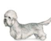
Dandie Dinmont Terrier