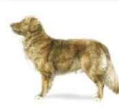
Nova Scotia Duck Tolling Retriever