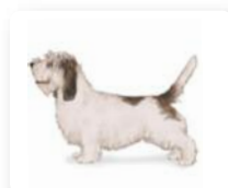
Petit Basset Griffon Vendéen