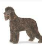
Irish Water Spaniel