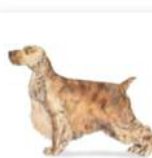
English Cocker Spaniel