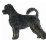
Portuguese Water Dog