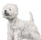
West Highland White Terrier