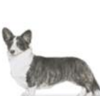
Cardigan Welsh Corgi