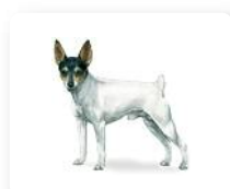
Toy Fox Terrier