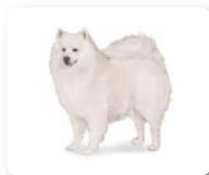
American Eskimo Dog