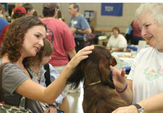
Responsible Dog Ownership Days give our beautiful breeds the opportunity to meet their adoring public.

We'd love to hear from you about what you think about our organization and our staff. Please write to us at feedback@akc.org