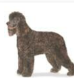
Irish Water Spaniel