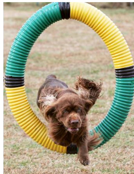
The solid, one-piece agility tire is being phased out.

For more information, and to see the new equipment in use, see the video at the AKC YouTube channel.