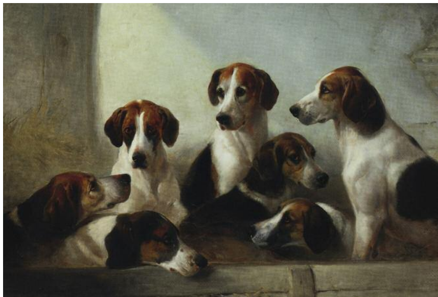
Smythe: Favourite Hounds, $116,500

Sam Travers, a Bonhams 19th-century art expert, says. "Their individual characteristics are depicted in such detail and in such a variety of poses displaying the incredible skill of this fine Suffolk [England] artist."