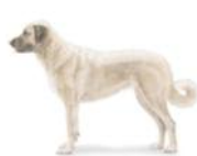
Anatolian Shepherd Dog