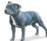
Staffordshire Bull Terrier