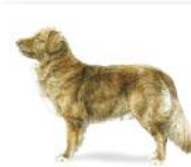
Nova Scotia Duck Tolling Retriever