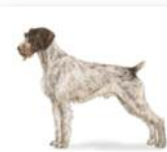
German Wirehaired Pointer