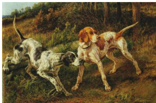
Osthaus: Two Pointers in a Landscape, $40,000

View the complete auction results at bonhams.com .