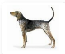
American English Coonhound