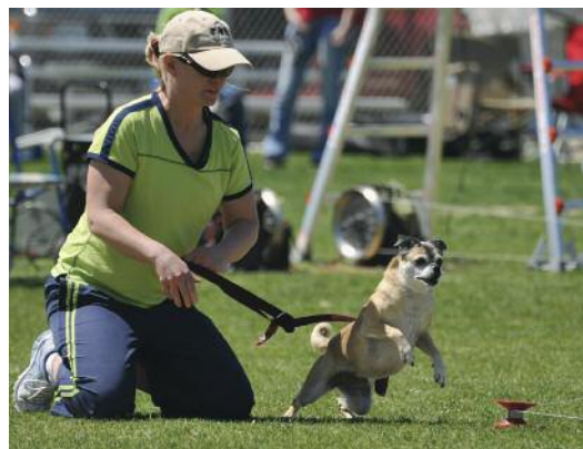
Coursing Ability Test: part of “what’s working.”

“AKC My Dog Can Do That!” has proven to be extremely successful in